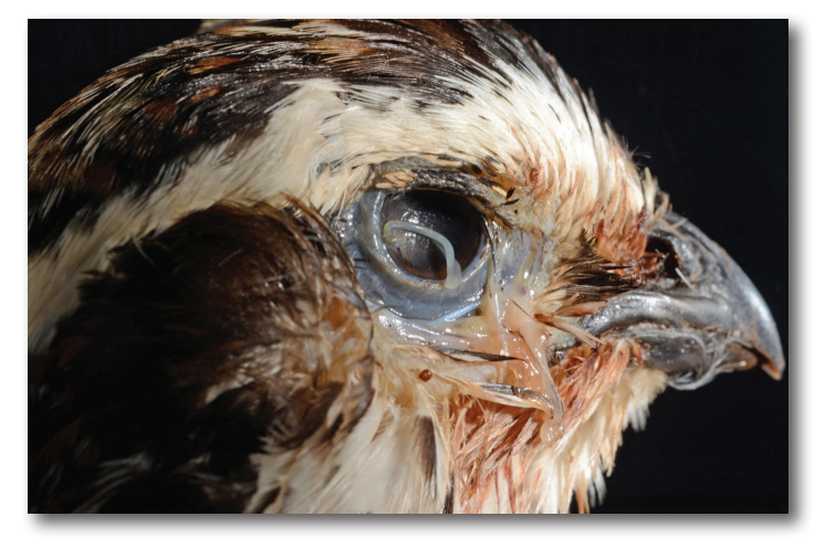
Texas bobwhite with eyeworm (Oxysprirura petrowi) in the eye.