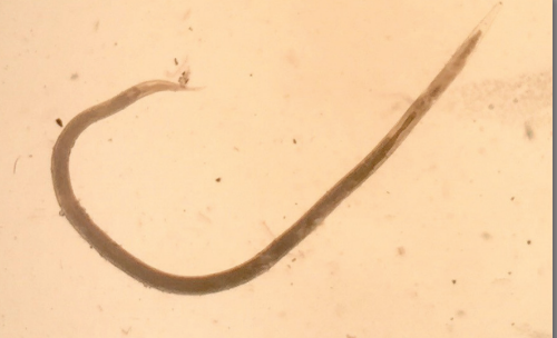
Oxyspirura petrowi from Texas bobwhite under the microscope at the Eyeworm Workshop, Joint Quail Conference, July 27, 2017.